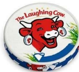
(540): The Laughing Cow

(210) Application Number : BT/M/0001/1575449 (220) Application Date : 24/11/2022 (731) Applicant Name : BEL (731) Applicant Address : 2 Allée de Longchamp F-92150 SURESNES, France (750) Representative: 16 rue Milton F-75009 Paris (526) Disclaimer : (571) Colour Claims: Blue - Pantone PMS 7685 C (C = 95, M = 69, Y = 0, K = 0) and red - Pantone PMS 485 (310)(320)(330):